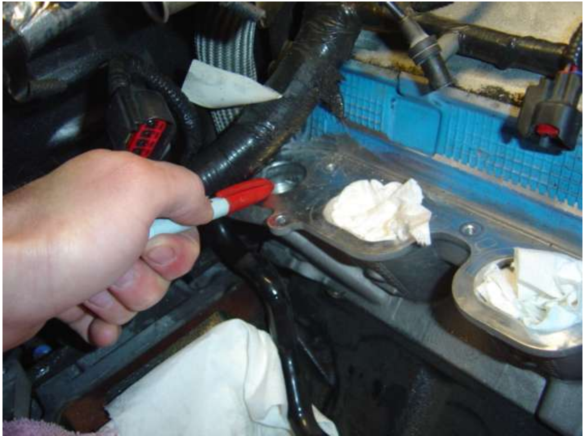
This fitting allows hot coolant to circulate from the driver's side rear head directly to the upper radiator hose for circulation through the radiator once the thermostat has opened. This coolant jacket is located directly behind the last intake manifold runner on the driver's side and has a freeze out plug installed from the factory.

The stock cooling system on a 2003-2004 Cobras, along with other 4.6 DOHC applications, has no provisions for the hot coolant to escape from the rear of the driver's side head. This creates potential hot spots/steam pockets in and around the rear 2 cylinders (#7&#8) as the heated coolant tries to make its way back to the front of the cylinder head toward the radiator. By creating a direct path back to the radiator, coolant flow in this area is increased. Additionally, this system allows the passenger side coolant flow through the heater core to remain factory stock, with the exception of increased flow via removing part of the coolant flow restrictor contained within the inlet hose to the heater core.